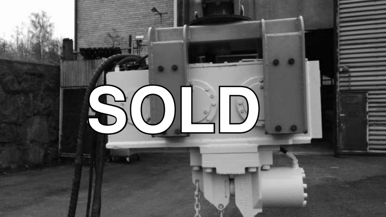
EXCAVATOR MOUNTED VIBRATOR ABI HVR 60