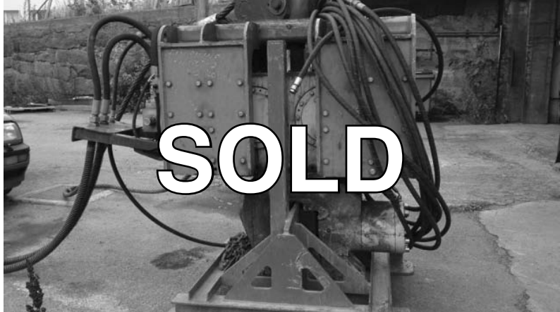
EXCAVATOR MOUNTED VIBRATOR ABI HVR 100 Z