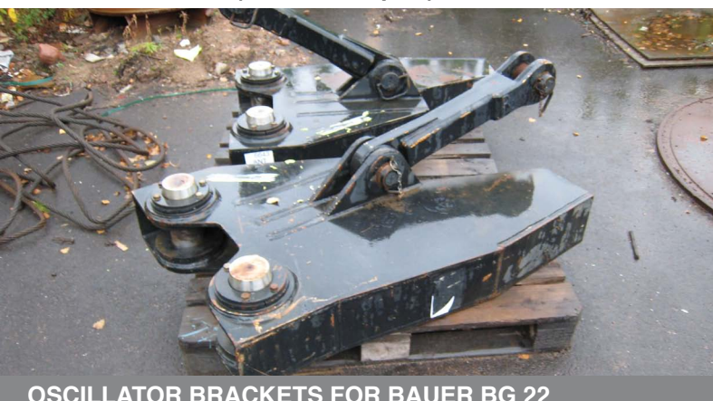
OSCILLATOR BRACKETS FOR BAUER BG 22