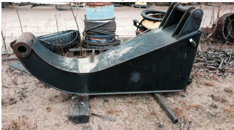
GOOSE NECK FOR EXCAVATOR MOUNTED VIBRATOR