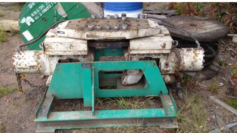
CLAMPING DEVICE FOR TUBES ABI S-526.Z01.0/0