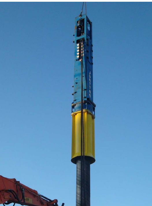
JUNTTAN PILING HAMMER HHK-7A