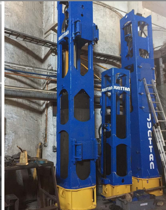
JUNTTAN PILING HAMMER HHK-6