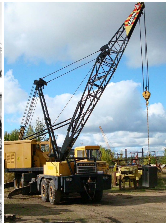
LORAIN MC-550A LATTICE BOOM TRUCK CRANE